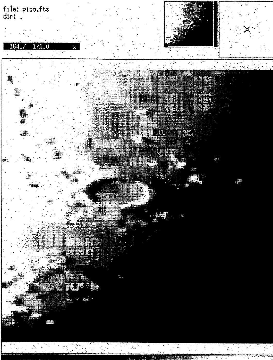
Figure 2. Image of the moon used for the determination of the heights of lunar mountains. The shadow of Pico is shown. The image was taken by Michael B. Hayden on November 3, 1993, at 23:30 UTC, using a Lynxx CCD camera attached to a Celestron C-8 telescope.